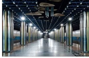
Kyiv Metro completely stopped