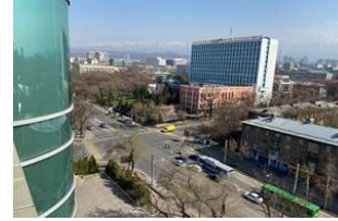
View from Almaty office. Almost empty streets.