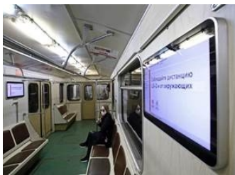
Moscow Metro operating, in Moscow.

Below please find a few impressions of cities we have offices in, as it looked like yesterday and today.