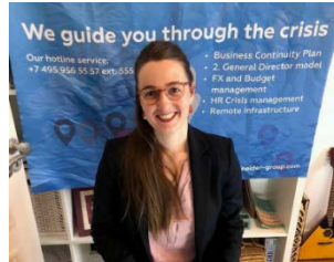
SCHNEIDER GROUP Home Office