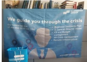
SCHNEIDER GROUP Home Office design