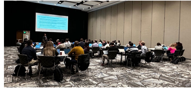
Pictured above and right: Trainees attend the inaugural LEA Global Tax Levels Training